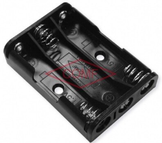
BH-431-1A Shown Without Leads