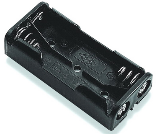
BH-421-3A Shown Without Leads